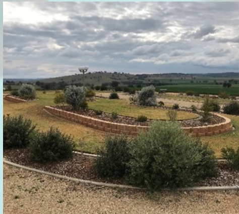
Alisha & Jamie WRIGHT 'SPRINGFIELD' Cowra Road (17ks, turn right just before the blue church, onto BrundahHall Road-3.5ks-property on left) New Semi-Formal Australian Native Garden GARDEN NUMBER 3