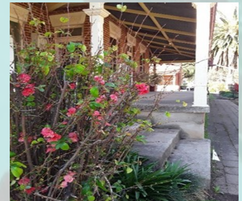
Lauren & Charles HARVEY MYLANDRA PARK 25ks Gooloogong Road Turn left on Wheatley's Road, 5ks, house on left Expansive Country, Garden GARDEN NUMBER 6