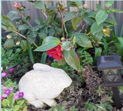
Noelene PERCEVAL Unit 7 Corner Tyagong & Melyra Street Quaint Courtyard Garden GARDEN NUMBER 1