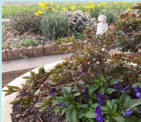
Bernadette DYKHOFF 62 Gooloogong Road Large Well Established Garden GARDEN NUMBER 4