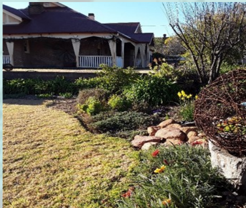
Cherie & Graham PATTRICK 31 Forbes Street Enclosed Established Garden GARDEN NUMBER 2