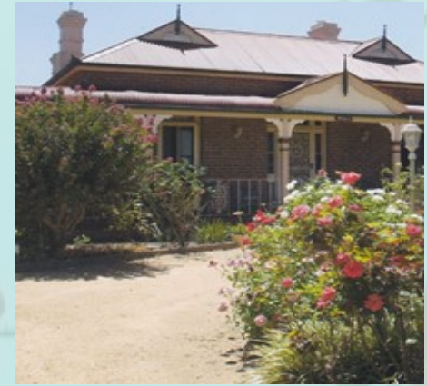
Val & Barry KNIGHT 'MELYRA' 122 Bald Hills Road (3ks on the Gooloogong Road, turn left) Large established Garden GARDEN NUMBER 5